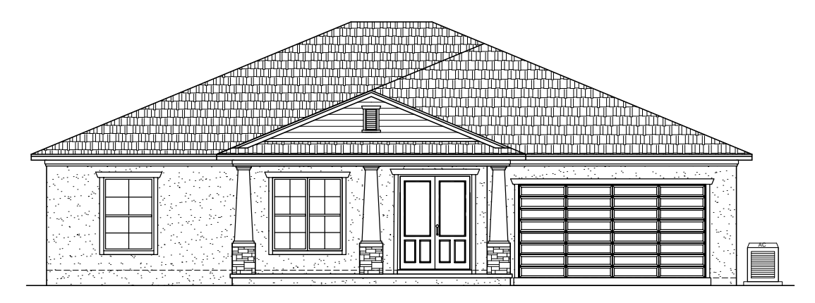
THE GAINESVILLE (59'-6"W X 60'-6"D) © COPYRIGHT TRINITY DRAFTING LLC